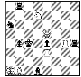
#2 6+7 1...Ξh5/b3/Ξb5 2.<u>Ξgxe4/Ξexe4/營xe4</u># 1.<u>@xe4!</u> [2.營d5#] 1...Ξh5/b3/Ξb5 2.@f3/@d3/@d5 #

Marjan Kovacevic 3<sup>rd</sup> Com Sradba na Solidarnosta 1996